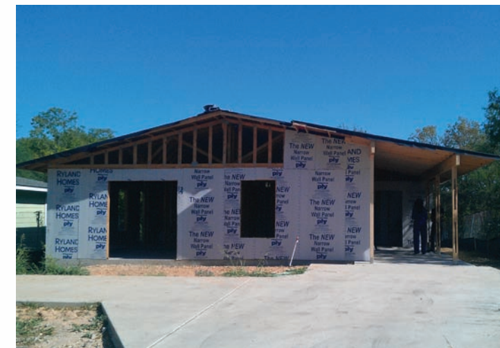
This second, energy-efficient home for low-income, first-time homebuyers is being built by YouthBuild participants. It is expected to be completed by late December.